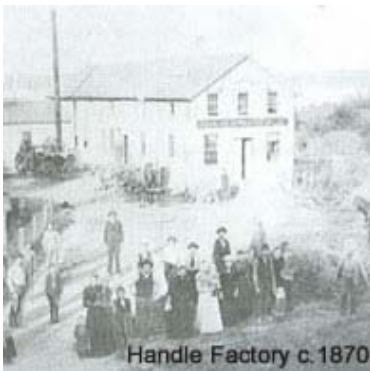
Handle Factory c. 1870