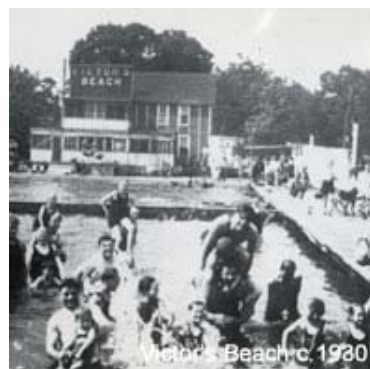
Water Beach c. 1930

Just because the Museum closes for the winter doesn't mean that our programming will end! Join the Cedar Lake Historical Association for these special programs: